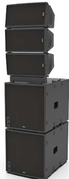
MSUB12 deployed in a stack array with GEO M6.

The MSUB12 shares the same phase response as other NEXO speakers, making it extremely easy to mix with other NEXO systems, e.g with the larger MSUB18 or with other NEXO subs, without risk of comb filtering or requiring complex electronic adjustment.