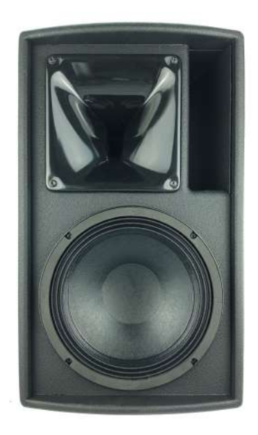
Grille removed, the large PS horn used with the HF driver

ePS10-EN54 acoustic phase response is NEXO phase signature allowing inter-operability between all NEXO speakers at all crossover points, except for the monitor setups where latency is minimized.