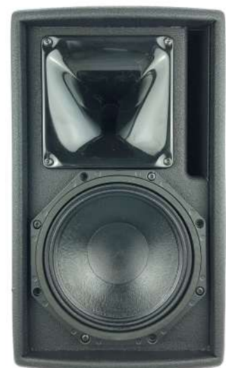
Grille removed, the large PS horn used with the HF driver

ePS8-EN54 acoustic phase response is NEXO phase signature allowing interoperability between all NEXO speakers at all crossover points, except for the monitor setups where latency is minimized.