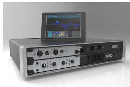
DTD and companion amplifier DTDAMP with Dory remote control software running on an Android tablet.

The mini-USB port allows the user to update the unit firmware from the Dory software, to add new functions or to download new NEXO speaker presets.